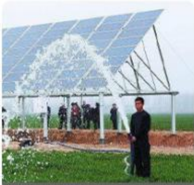
Water hepumping and drip irrigationater