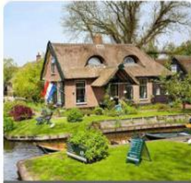
village and town water supply