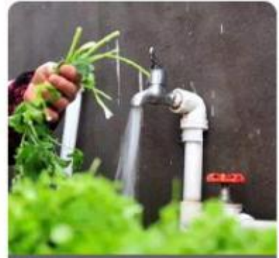
clean drinking water